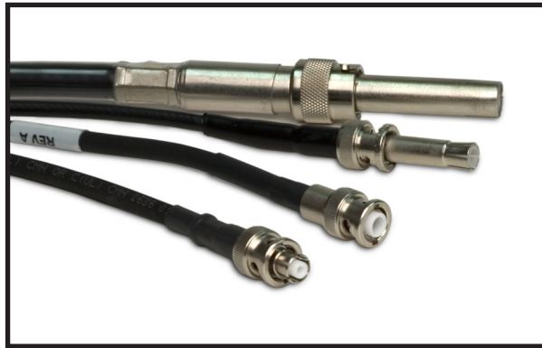
High voltage cables

Operation is simple. The parameter being adjusted or set is displayed separately and can be entered without affecting the actual output voltage. Up to nine instrument configurations can be stored and recalled at any time, making it easy to run multiple tests.