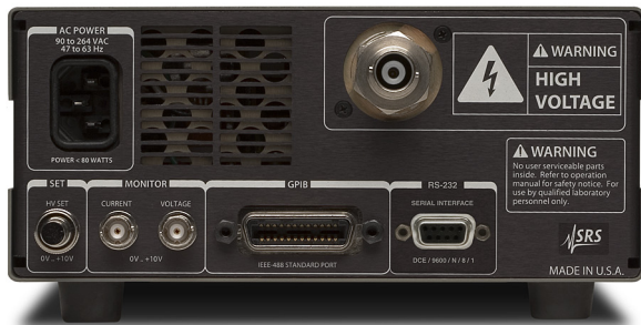
PS370 rear panel

Both GPIB and RS-232 computer interfaces are standard on all 10 W supplies. GPIB is available as an option on the 25 W instruments. All parameters can be set and read via the computer interfaces.