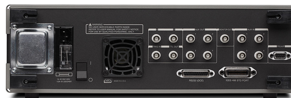
SR830 rear panel