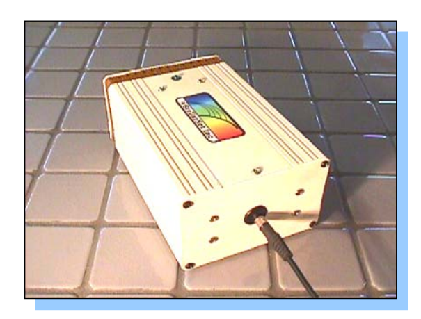
Worlds smallest 4000 hour deuterium light source for CW (continuous wave) UltraViolet for the 190-450nm range.