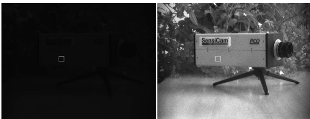
Figure 2 Left image: scaled to full scale 0 - 4095 => 0 - 255 Right image: scaled to minimum - maximum 62 - 190 => 0 - 255 exposure time = 10 ms (for white rectangle see legend figure1)