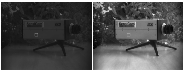
Figure 3 Left image: scaled to full scale 0 - 4095 => 0 - 255 Right image: scaled to minimum - maximum 167 - 1400 => 0 - 255 exposure time = 100 ms (for white rectangle see legend figure1)