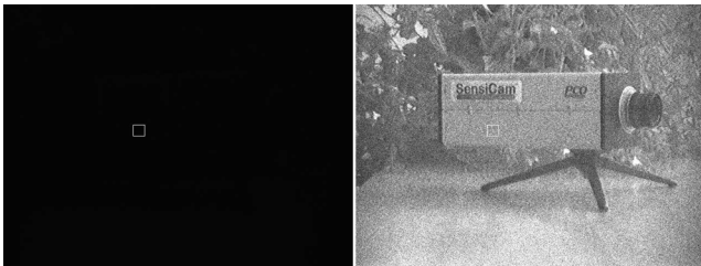
Figure 1 Left image: scaled to full scale 0 - 4095 => 0 - 255 Right image: scaled to minimum - maximum 53 - 75 => 0 - 255 exposure time = 1ms, the white rectangle shows the position and size of the area, which was used to calculate the values for the graph in figure 5.

The following series of images were taken with a 12 bit camera system using exposure times of 1ms, 10ms, 100ms and 500ms. The left images illustrate individual images scaled to maximum (gray levels of 0-255 correspond to 0-4095 counts). The images below show each image individually scaled to minimum-maximum