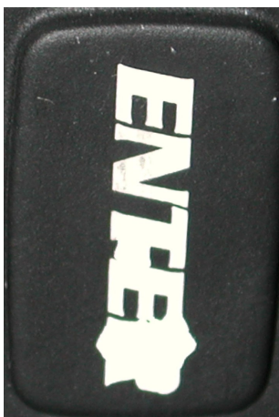
after 20000 strokes