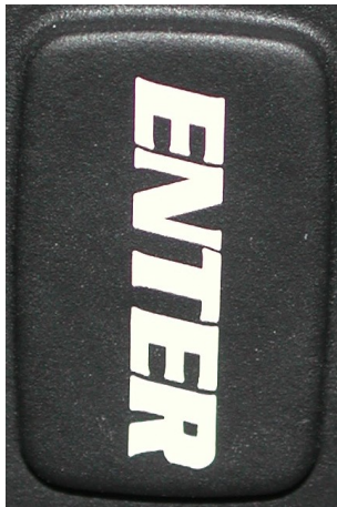
after 0 strokes