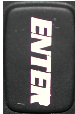
after 10000 strokes