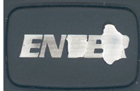
High resolution scan

After 20000 strokes the fabric was blackened by a residue from the plastic. After 10000 strokes the white color already started to smear (around the letter "R"). This smearing became a lot more pronounced as the test reached 30000 strokes, extending also to the letter "T". At 30000 strokes the residue started to blacken the letter "N".