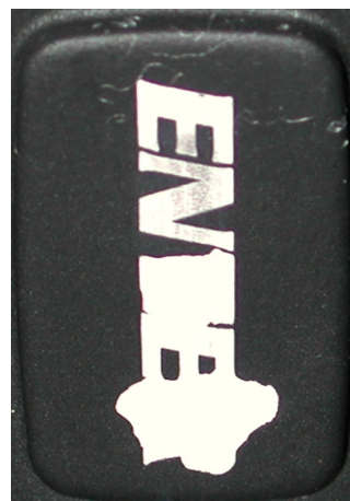
after 30000 strokes