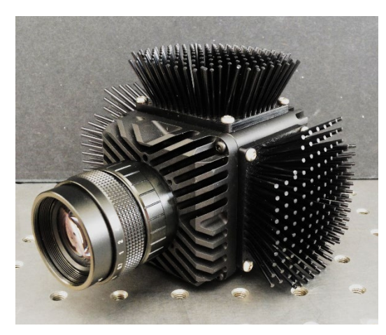
Passive heat sinks set-up