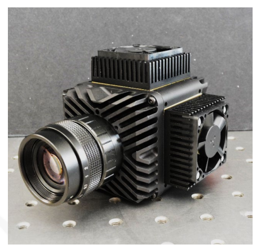
Example of a configuration with an external fan

An inexpensive way to improve thermal performances is to add an external fan blowing on the camera housing. Any fan can be used for this purpose. For utmost performance, this solution can be combined to the passive heat sinks. Depending on the airflow velocity, the case temperature will significantly decrease. Although very simple to set up, this solution has obvious disadvantages such as vibrations, noise, dust, or atmospheric disturbance.