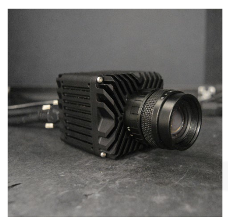
Example of a configuration with increased surface exchange

The effectiveness of passive dissipation is related to the total exchange surface. Any item that increases the surface of thermal exchange will optimize the dissipation, for example: