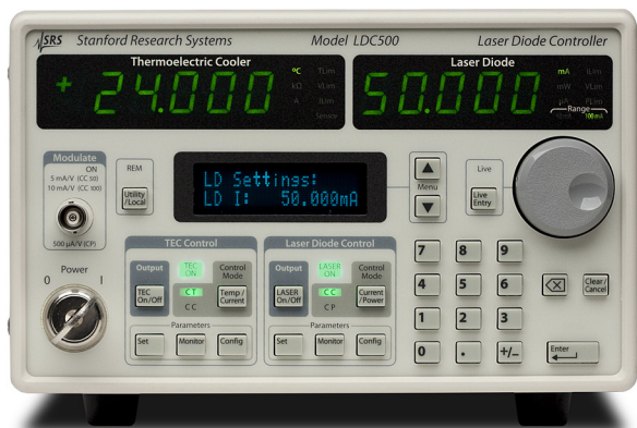
LDC500 front panel

The LDC500 series offers an auto-tuning feature which automatically optimizes the PID loop parameters of the controller. Of course, full manual control is provided too. Dynamic transfer between CT and CC modes for the TEC is also easy — just press the Temp/Current button.