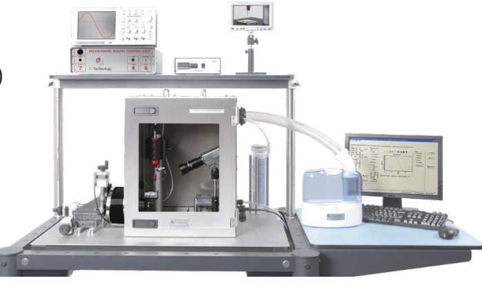
Relative humidity system model: RHC020 with 3-axis scanning