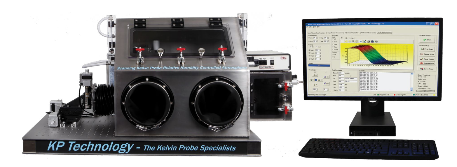
Relative humidity system model: RHC040 with 3-axis scanning capabilities