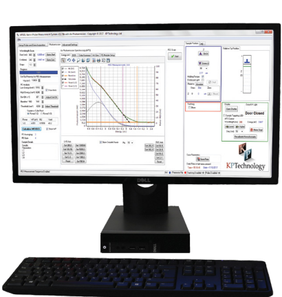
APS04-N2-RH system with ambient pressure photoemission spectroscopy, nitrogen environment and scanning capabilities