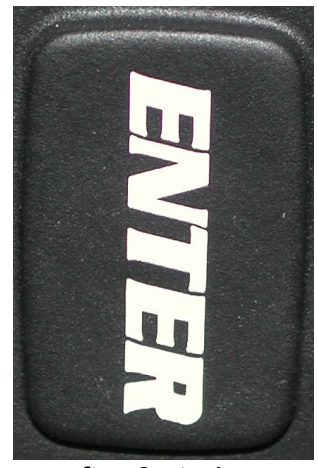
after 0 strokes