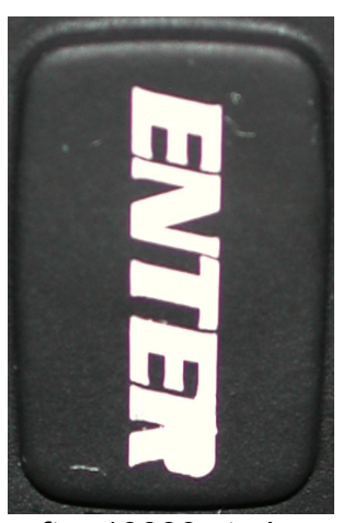
after 10000 strokes