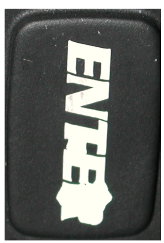
after 20000 strokes