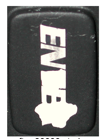
after 30000 strokes