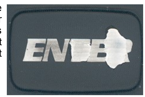
High resolution scan

After 20000 strokes the fabric was blackened by a residue from the plastic. After 10000 strokes the white color already started to smear (around the letter "R"). This smearing became a lot more pronounced as the test reached 30000 strokes, extending also to the letter "T". At 30000 strokes the residue started to blacken the letter "N".