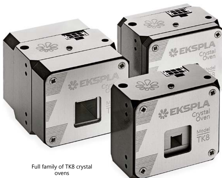
Full family of TK8 crystal ovens

Specifications are subject to changes without advance notice.