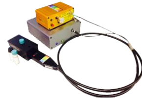
Raman Systems High Performance Spectrometers