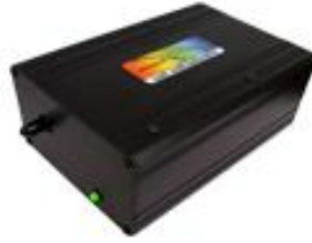
BLACK-Comet Concave Grating Spectrometers