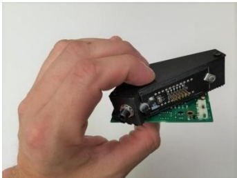
OEM NIR modules