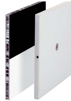
Lightweight and rugged for lab and field applications.