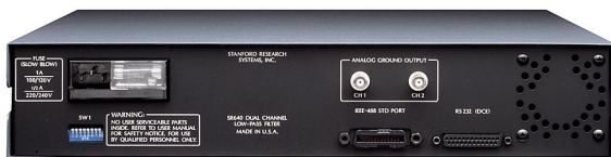
SR640 rear panel