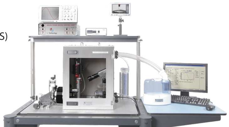
Relative humidity system model: RHC020 with 3-axis scanning