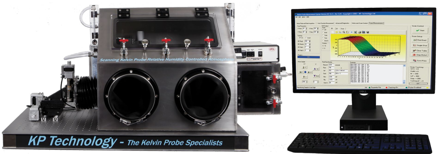
Relative humidity system model: RHC040 with 3-axis scanning capabilities